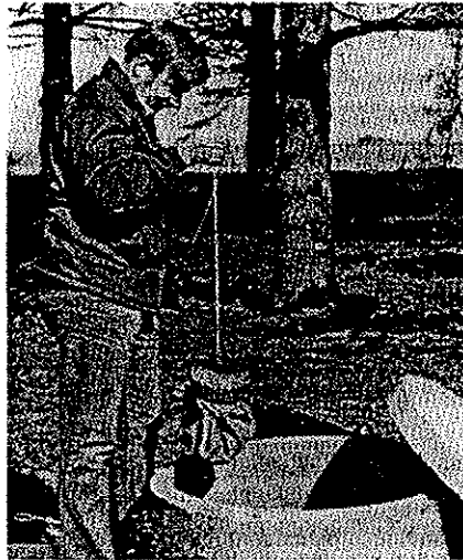
Fig. 3. Strong chlorine solution is recirculated back to the well.

Newly constructed wells, or those that have been submerged by flood waters, may contain substantial amounts of sediment that cloud the water and interfere with disinfection. Pump the well until the water clears before proceeding with shock chlorination.